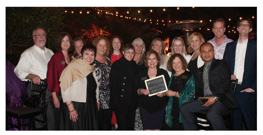
ALZGLA staff after a successful 2016 "An Unforgettable Evening," a private garden party and auction fundraising event.