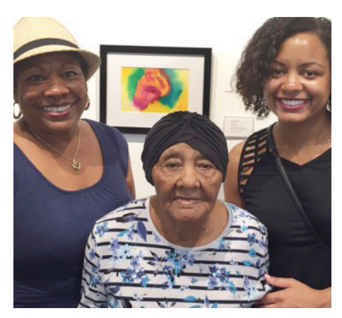
A "Memories in the Making" (MiM) artist and her family at the 4th annual MiM Gallery Exhibition and Auction.

Improving the lives of local families affected by Alzheimer's/Dementia by increasing awareness, delivering effective programs/services, providing compassionate support, and advocating for quality care and a cure.