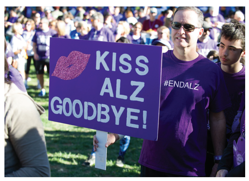
The crowd at the opening ceremony of the 2015 walk4ALZ Los Angeles.